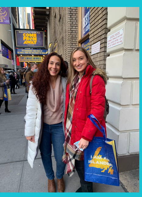
SCHOOL STAFF HAVE INCREDIBLE NYC MOMENT - PAGE 6 WARREN MONTHLY