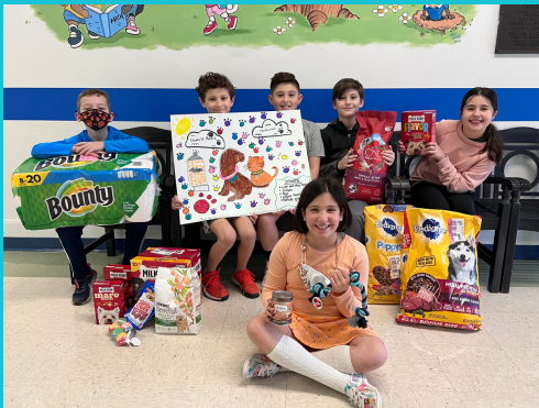
Central School Fundraiser