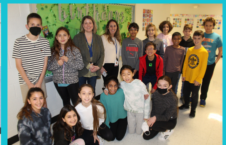
ALT celebrated Social-Emotional Day. SEL Day is a time to recognize all of the important Academic, Social, and Emotional Learning that happens daily at all Warren Schools.