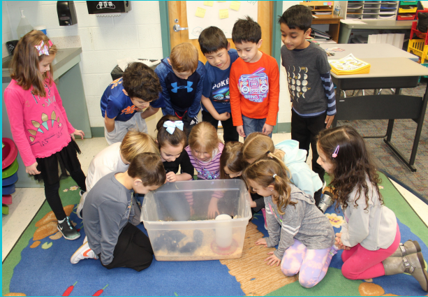
Signs of Spring at Mt. Horeb School