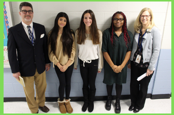
3 WSM students make a presentation to the WT BOE about the Dress Code.