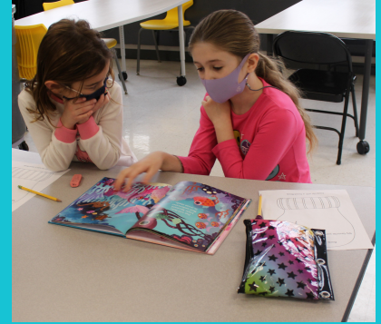
Cozy Book Buddy Program at Woodland School