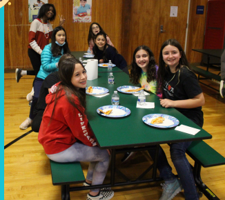
Pi Day at Mt. Horeb