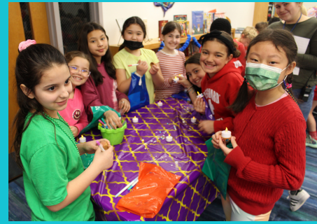
International Day at Central!