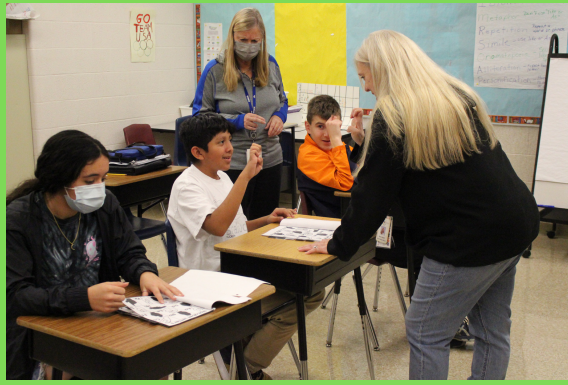
WMS Teacher Introduces ASL to Students